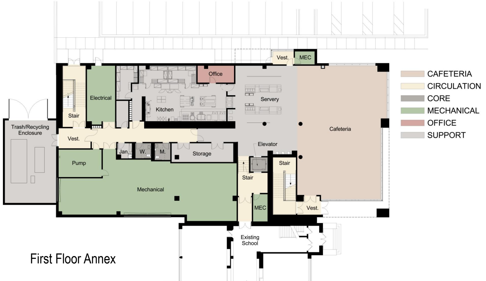
First Floor Annex