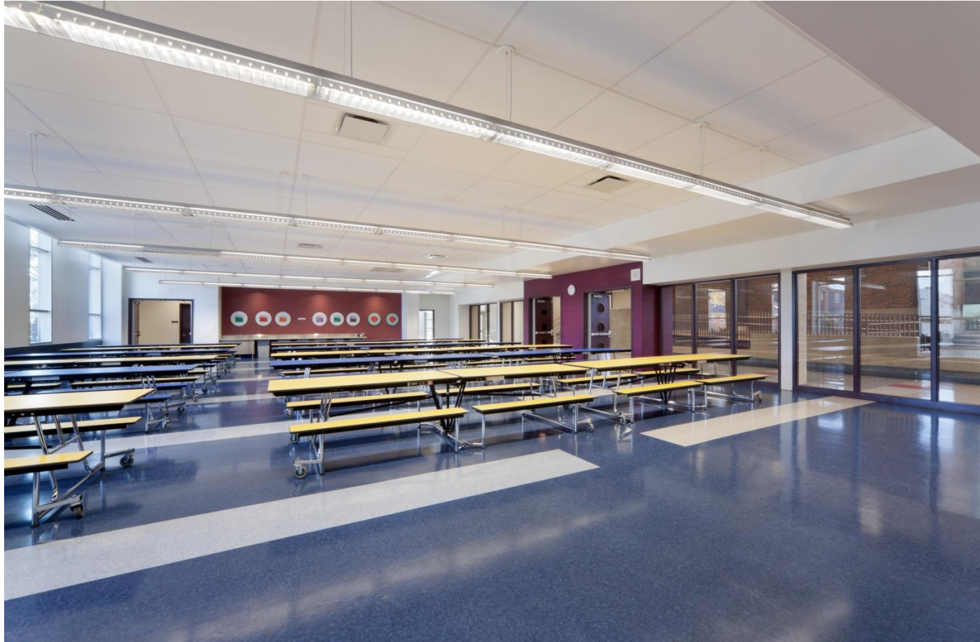
Kitchen and Dining Facilities at Mt. Greenwood Elementary School Addition

Nathan Hale Elementary School Annex & Renovation