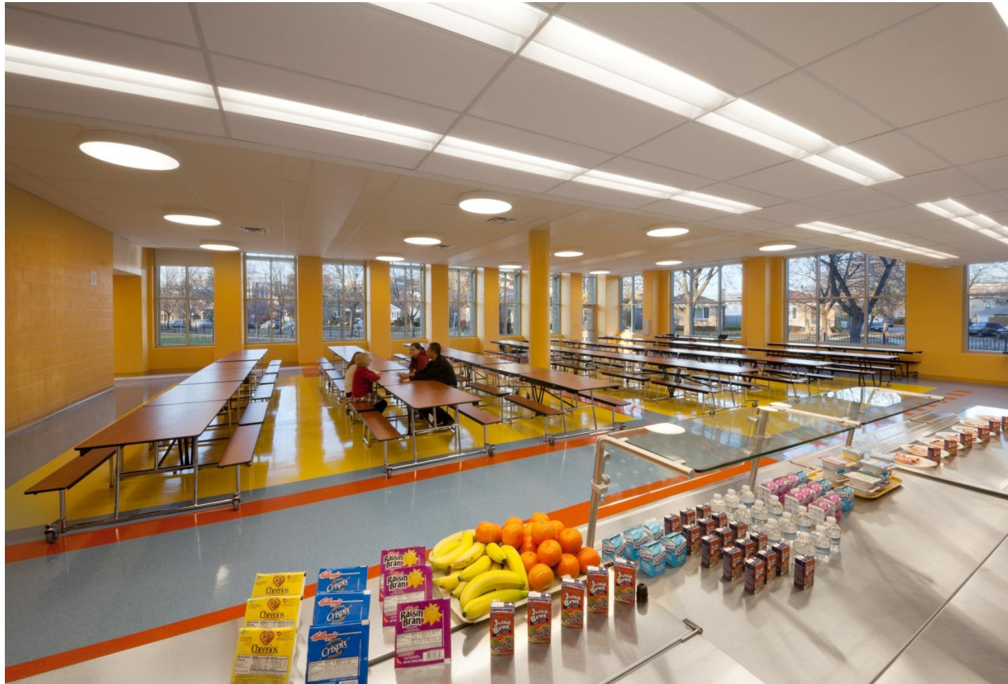
Kitchen and Dining Facilities at Sauganash Elementary School Addition