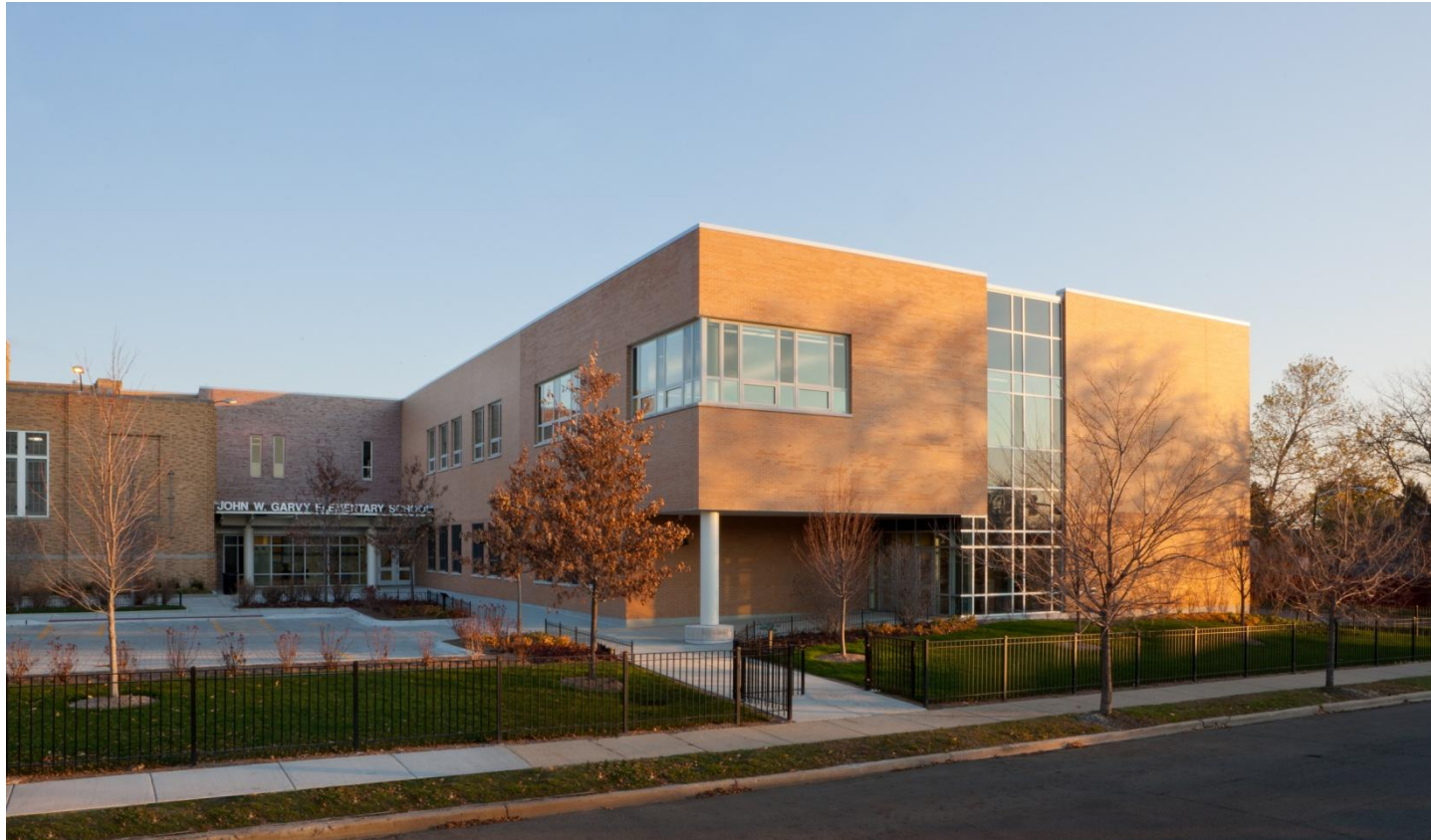
Garvy Elementary School Addition