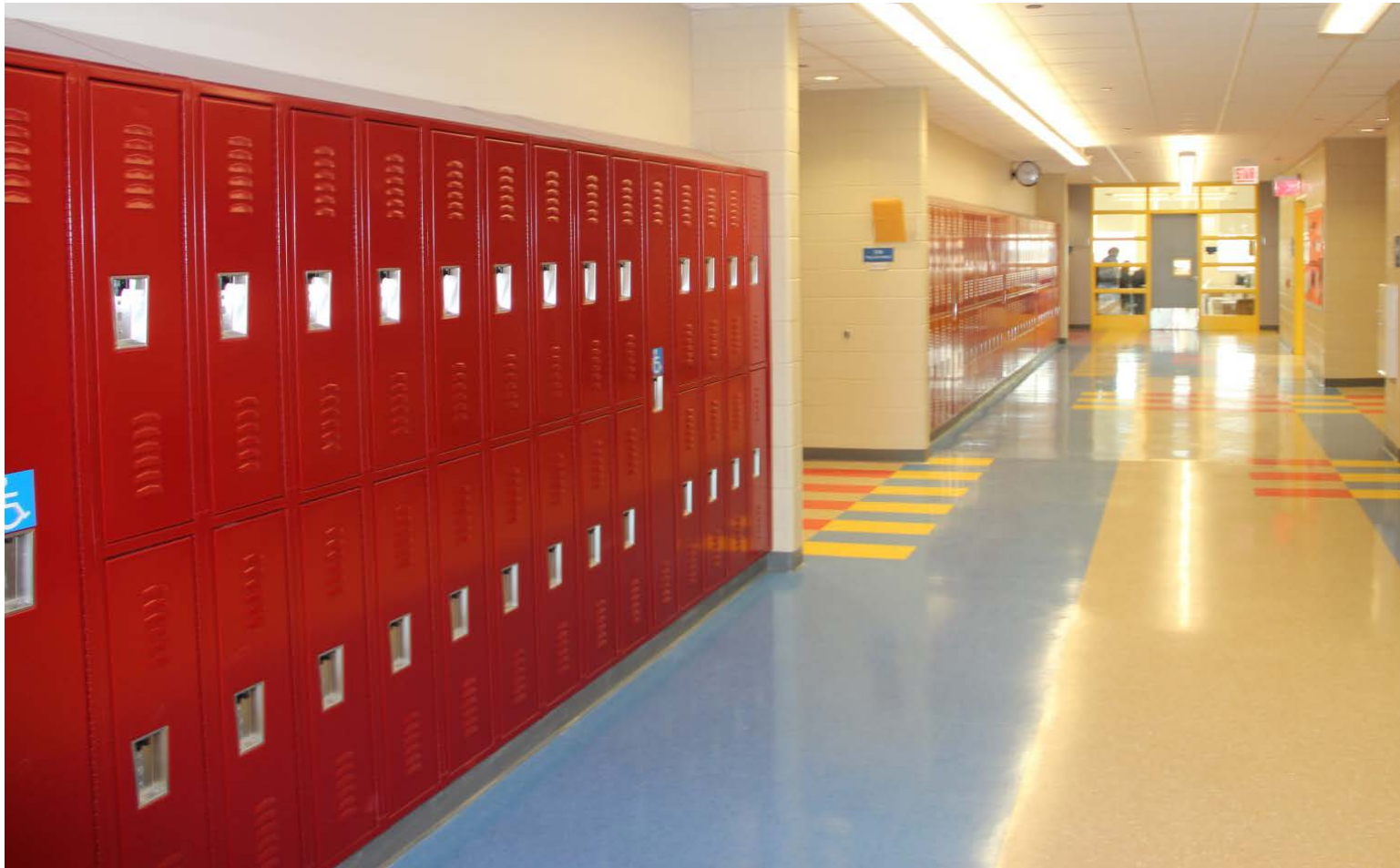
Corridor at Hale Elementary School Annex