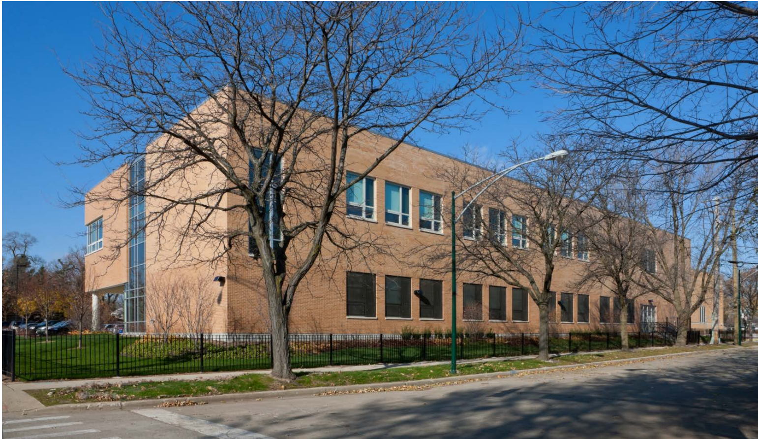
Garvy Elementary School Addition