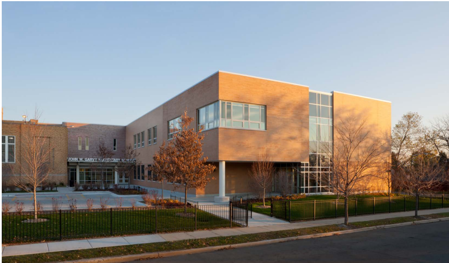
Garvy Elementary School Addition