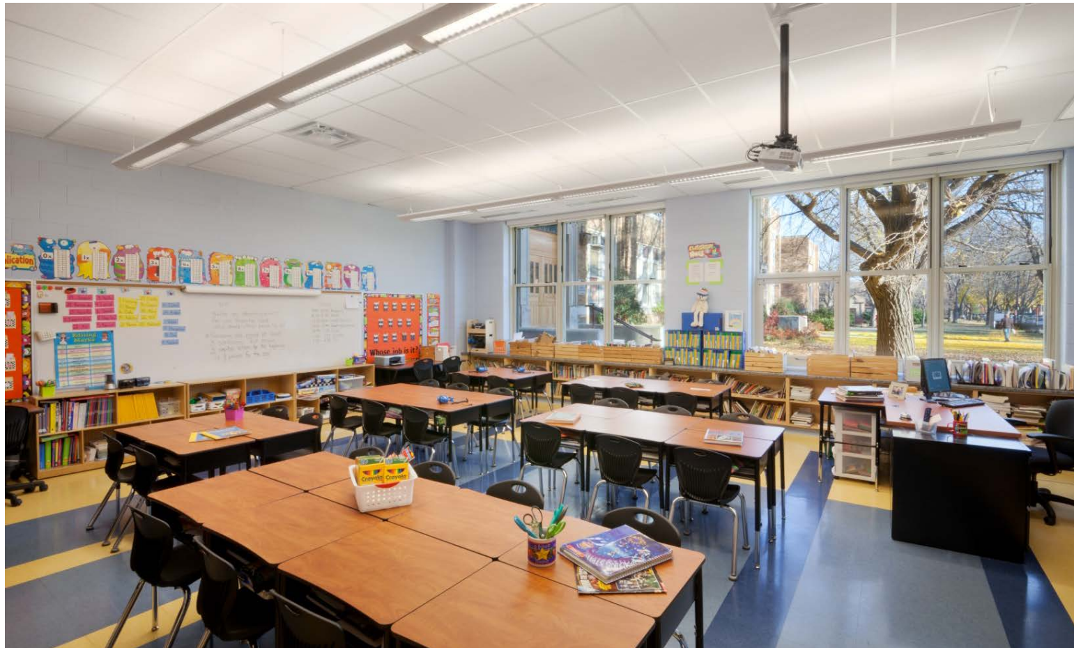
Classroom at Sauganash Elementary School Addition