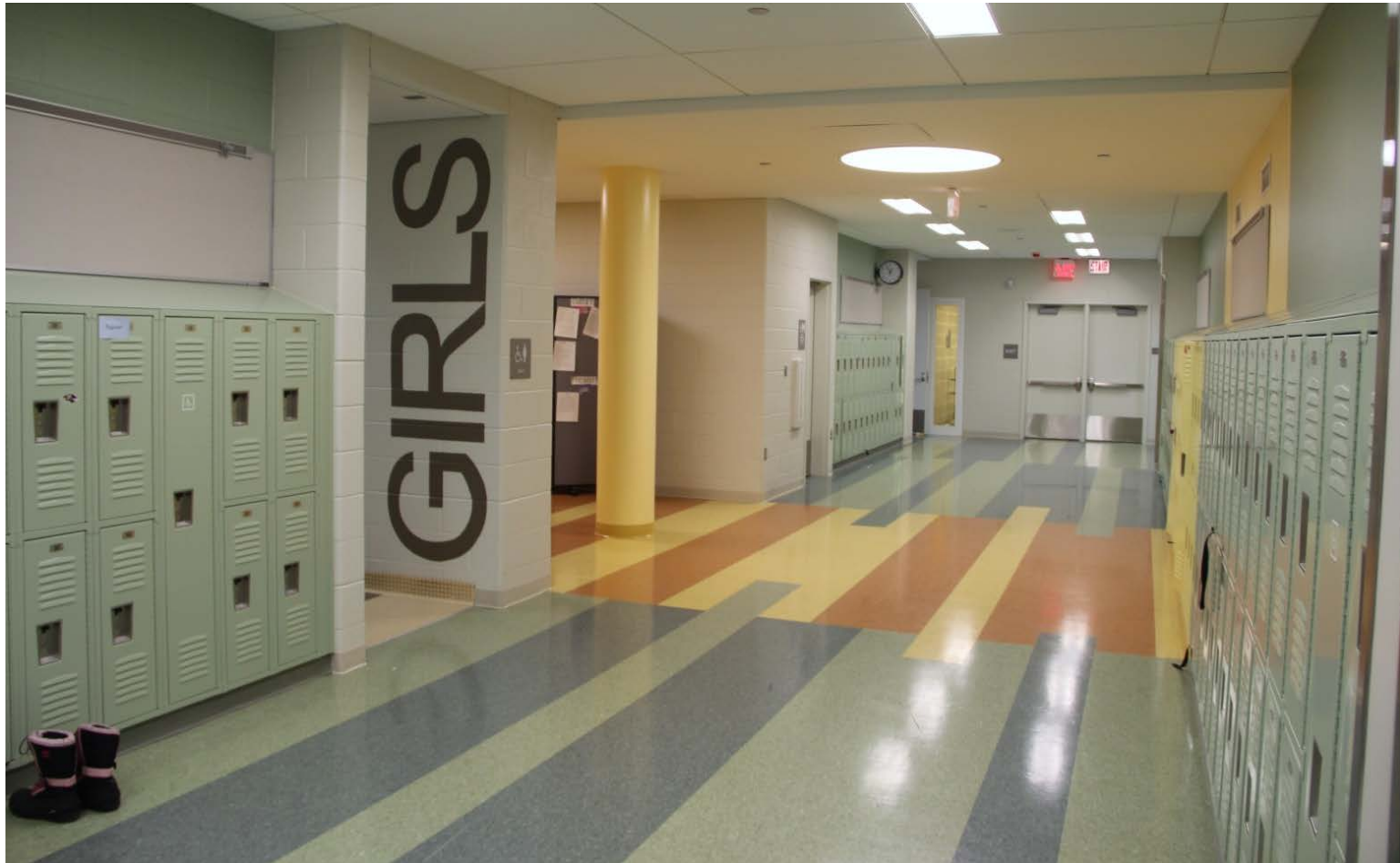
Corridor at Edison Park Elementary School Annex