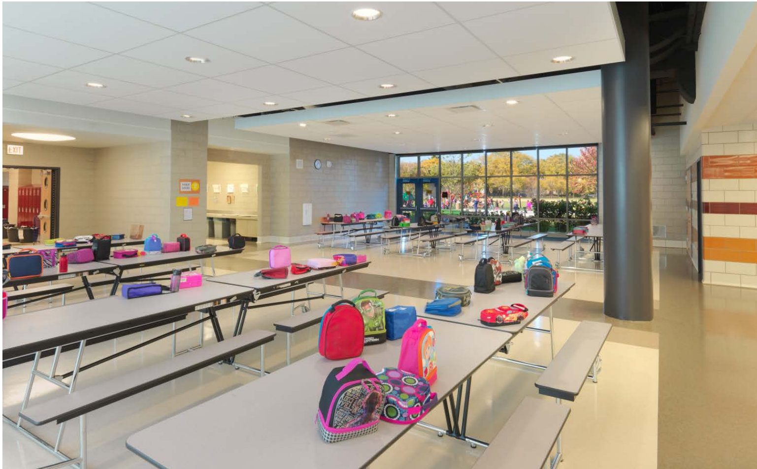
Kitchen and Dining Facilities at Edgebrook Elementary School Addition