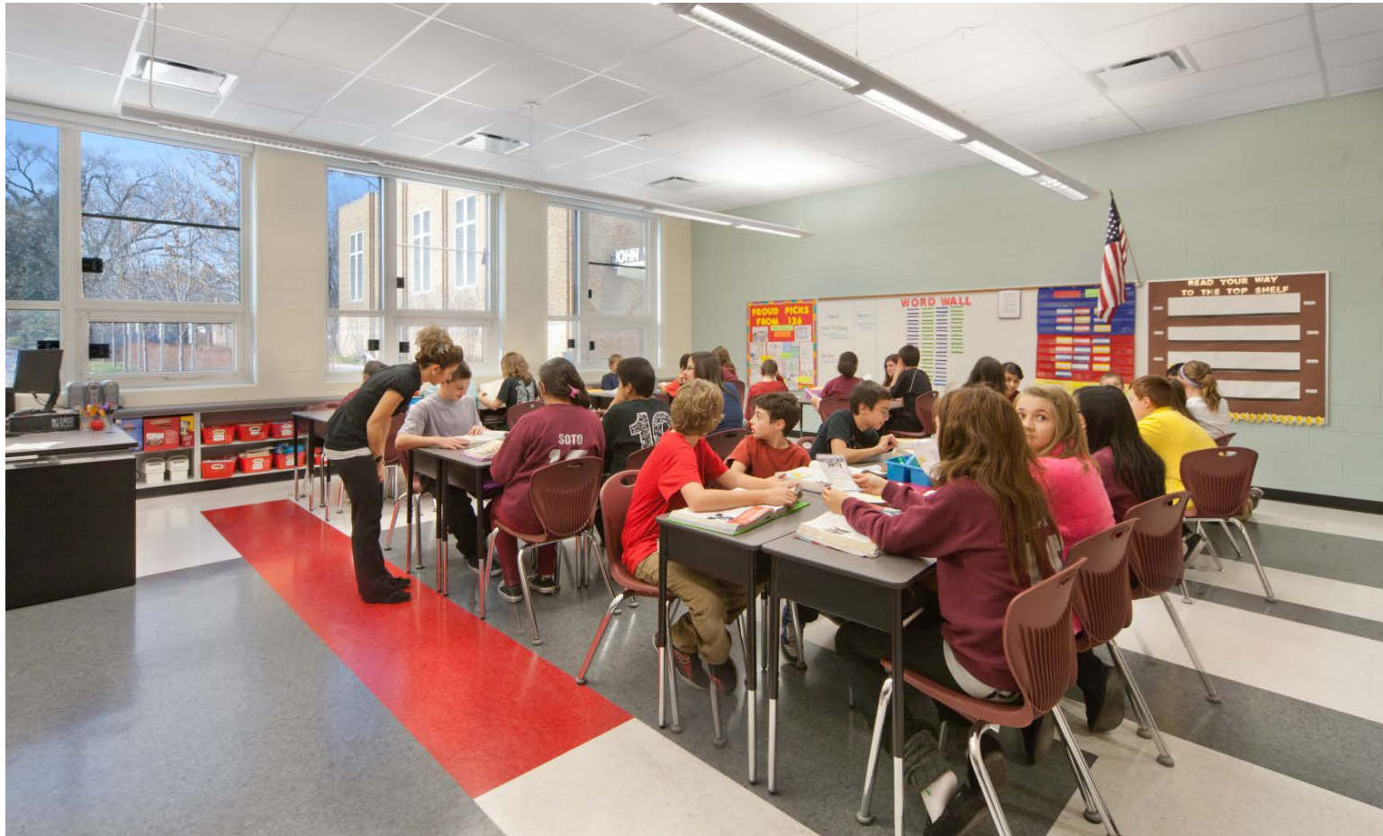
Classroom at Garvy Elementary School Addition