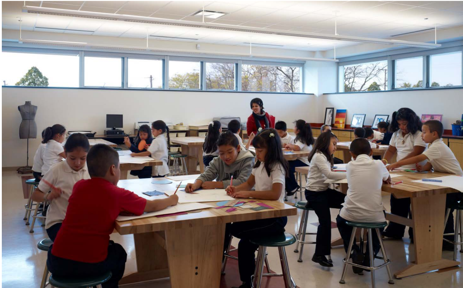
Art Classroom at Calmecca Academy of Fine Arts & Dual Language