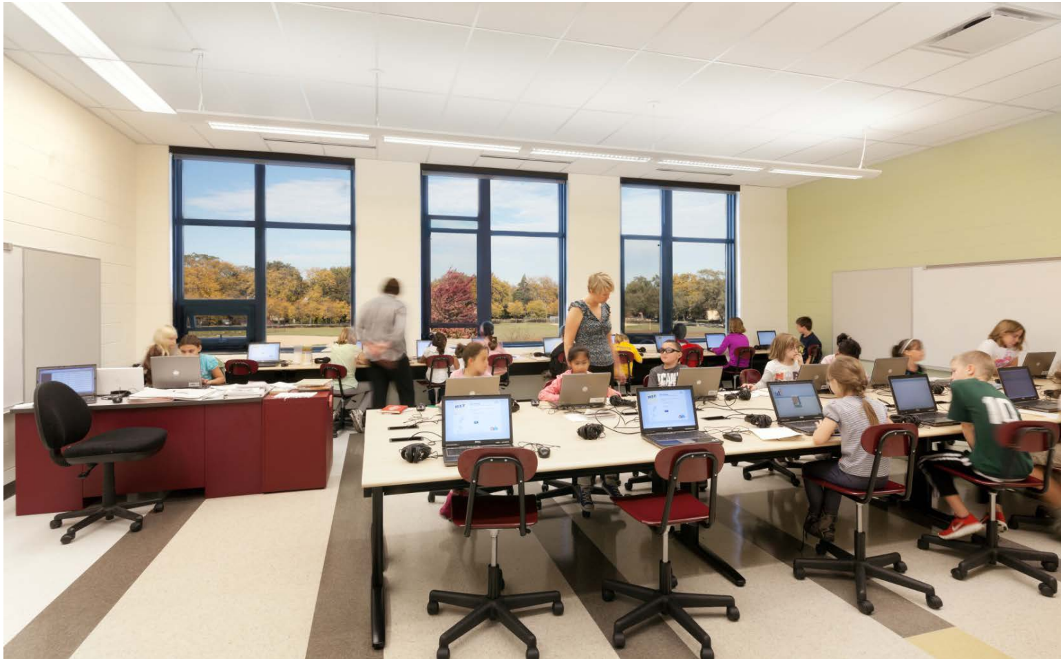
Computer Lab at Edgebrook Elementary School Addition