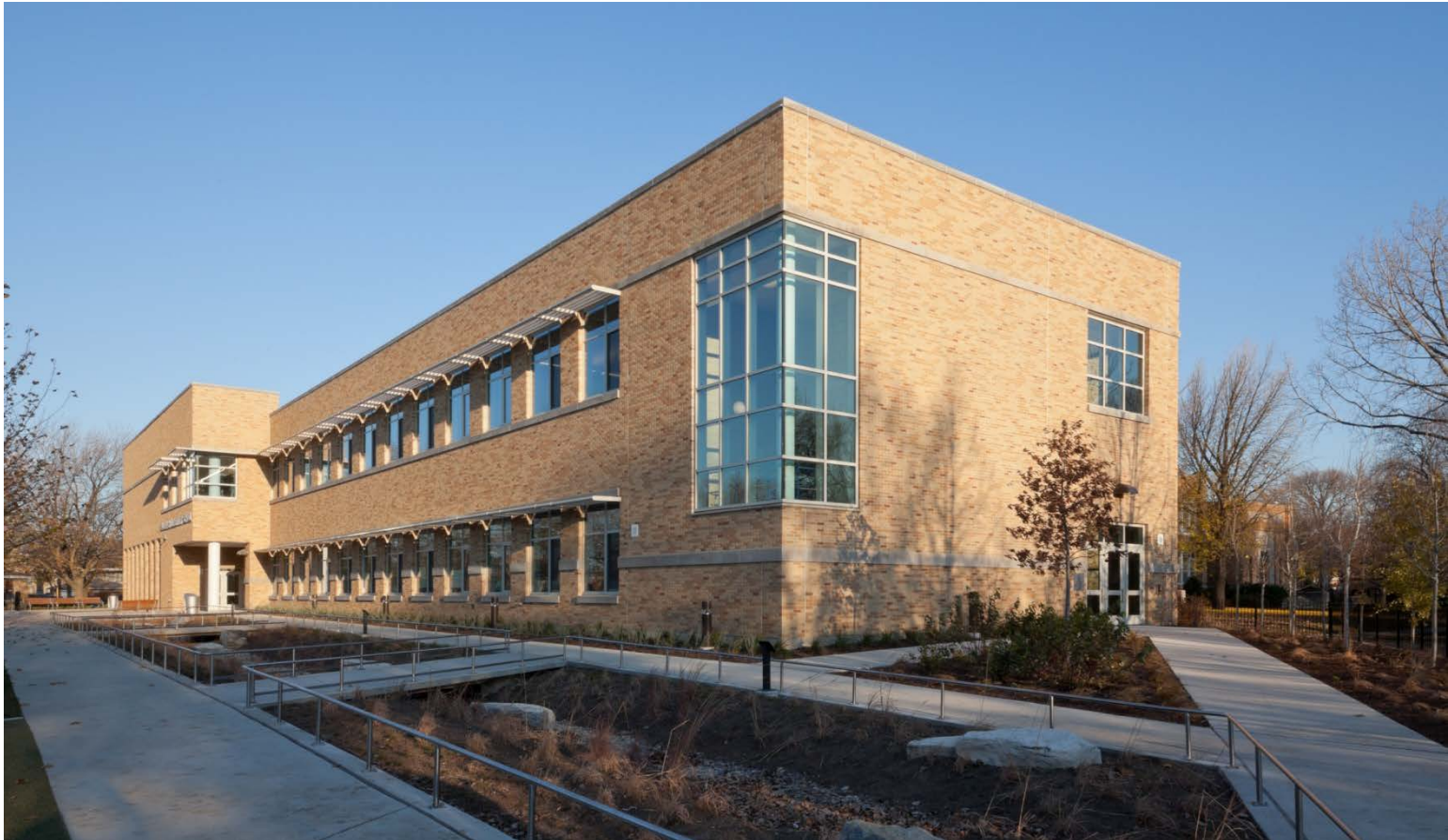
Sauganash Elementary School Addition