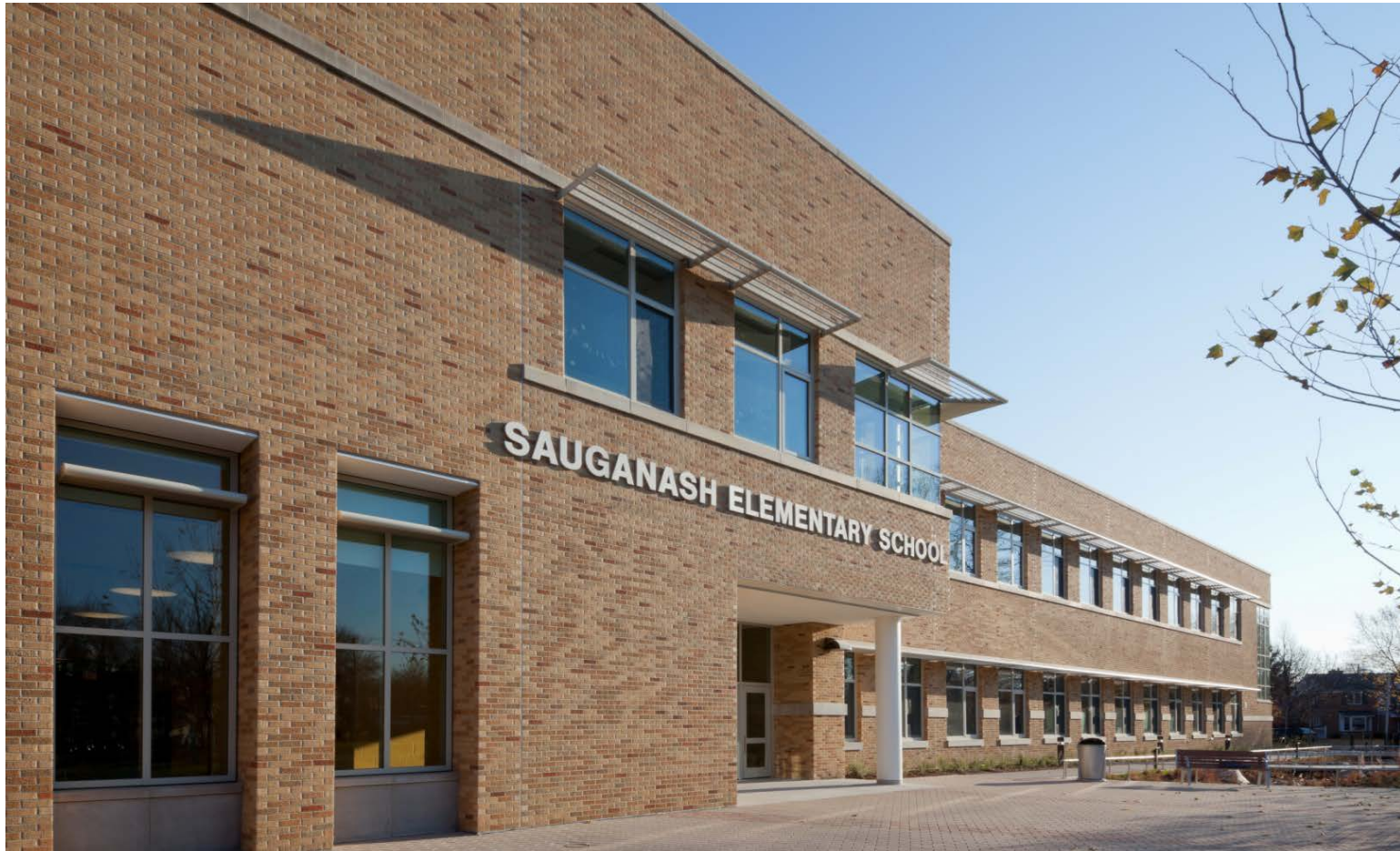
Sauganash Elementary School Addition