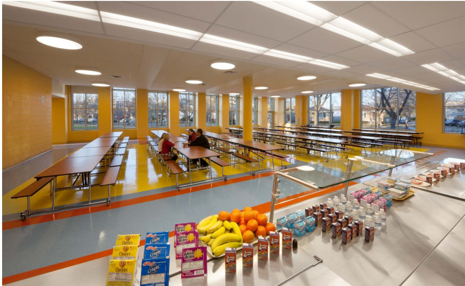
Kitchen and Dining Facilities at Sauganash Elementary School Addition