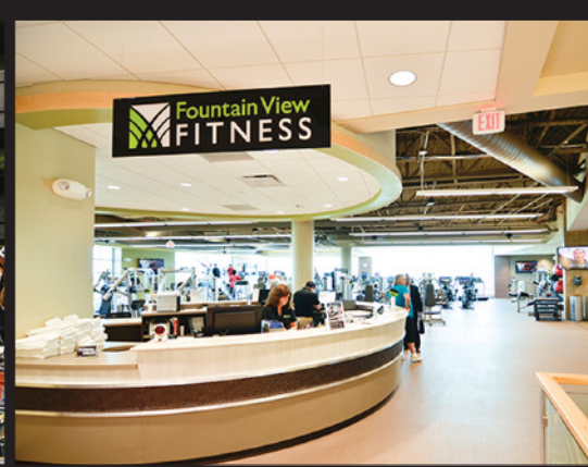
Carol Stream Park District Fountain View

Work included replacing 11,500 feet of track, wood ties, tie plates, power, signal, walkways and platforms. The work was completed over the course of 17, 54-hour week-end work windows and two, 9-day work windows reducing 8 days and saving over $500,000 in construction costs.