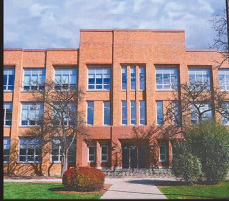
William Howard Taft High School