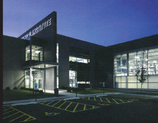
Universal Technical Institute