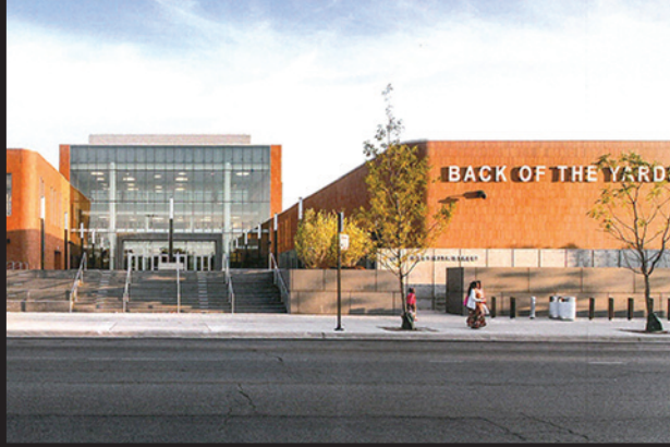
Back of the Yard Campus