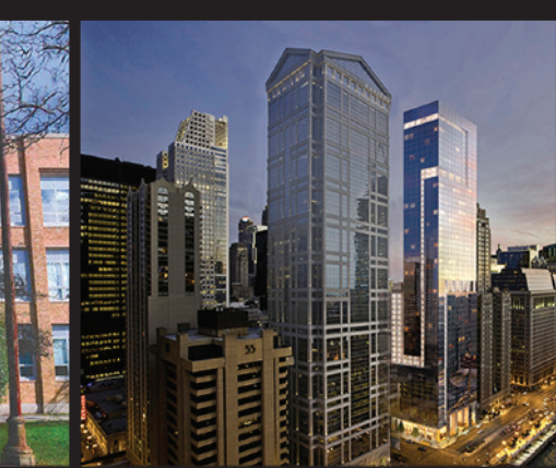
OneEleven West Wacker