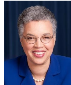
Toni Preckwinkle Cook County