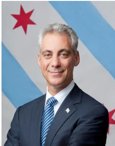
Mayor Rahm Emanuel Chairman