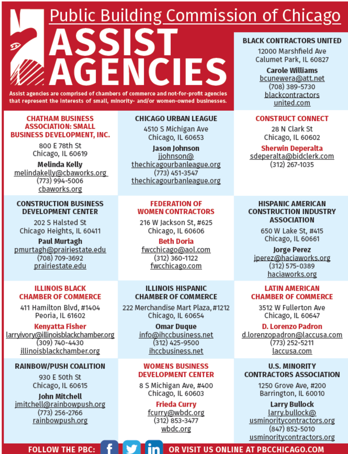
EXHIBIT #4 ASSIST AGENCIES