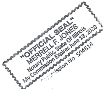
Notary Public My Commission expires: 6/18/2020

Subscribed and sworn to before me this 15th day May, 2017.