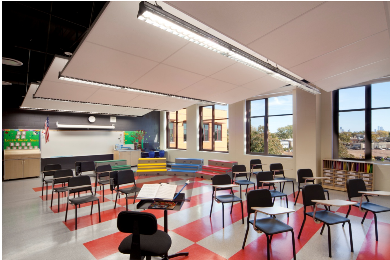
Music Classroom at Lorca Elementary School