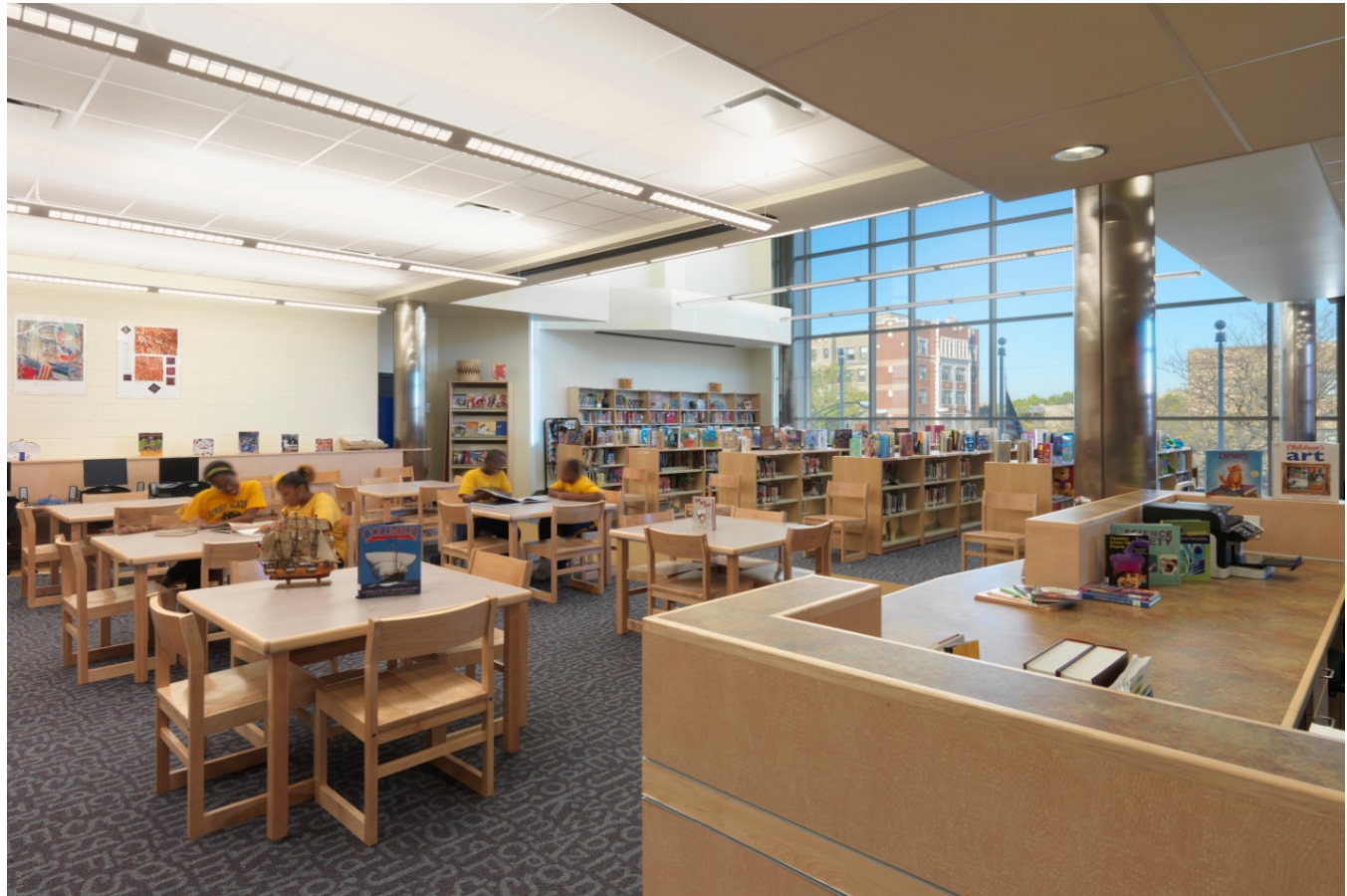
Library at Powell Academy