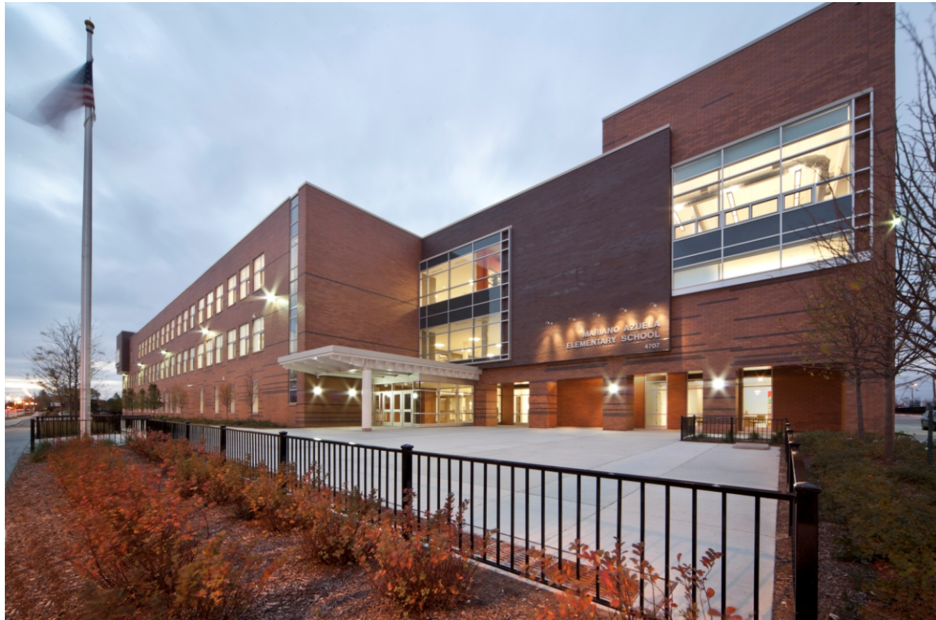
Mariano Azuela Elementary School