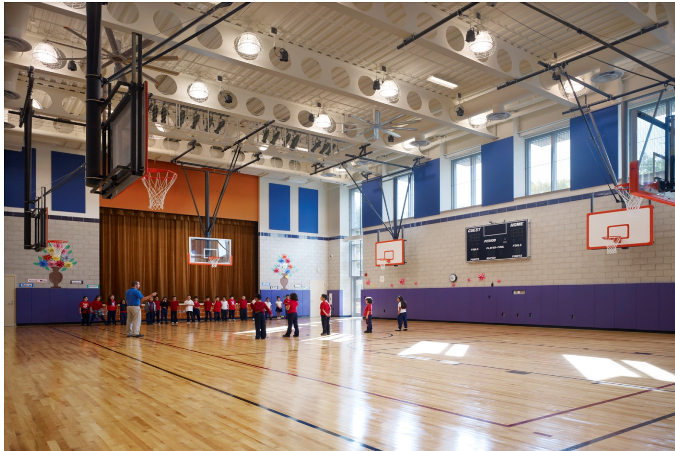
Gymnasium at Calmecca Academy