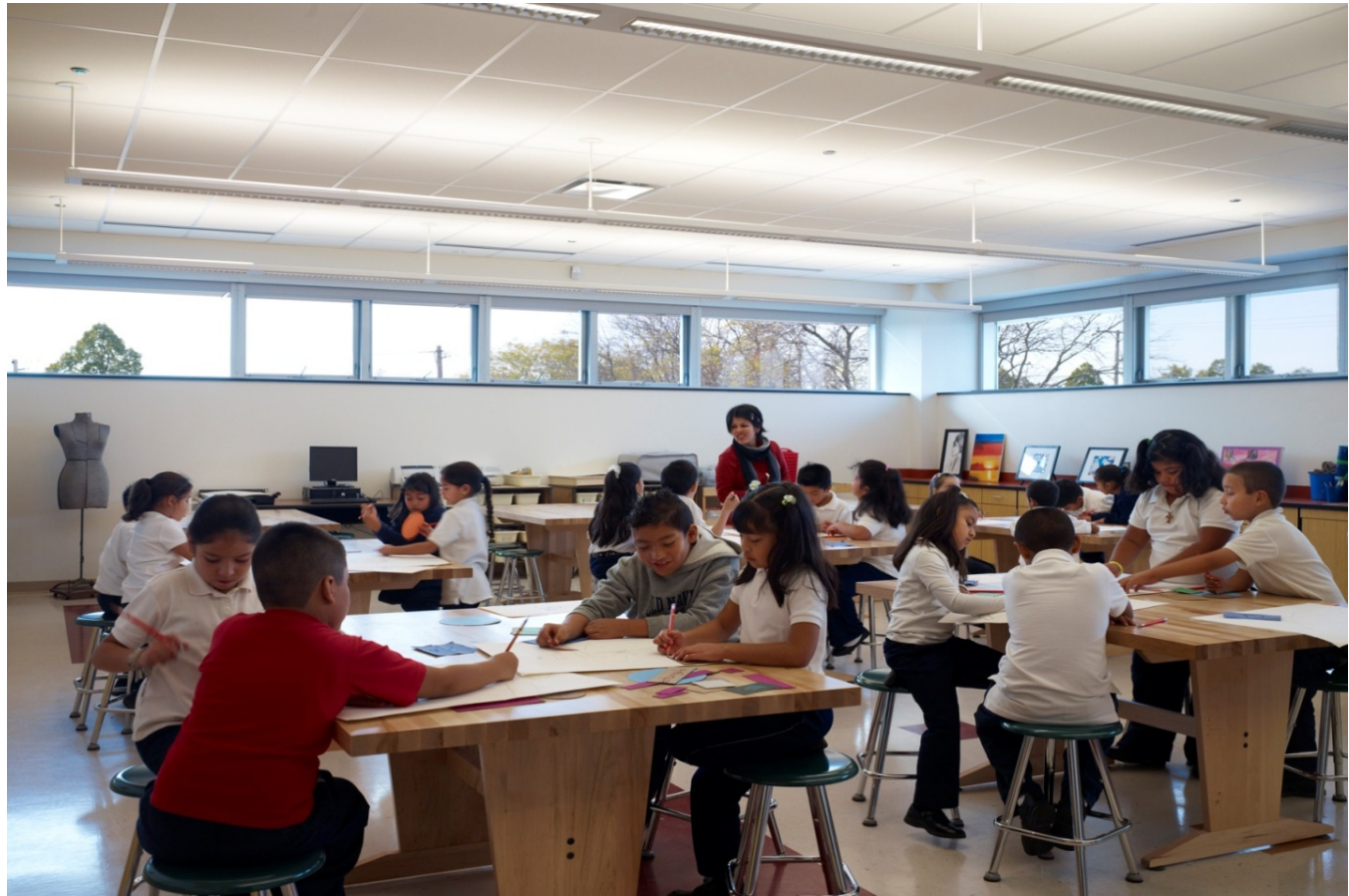
Art Classroom at Calmecca Academy