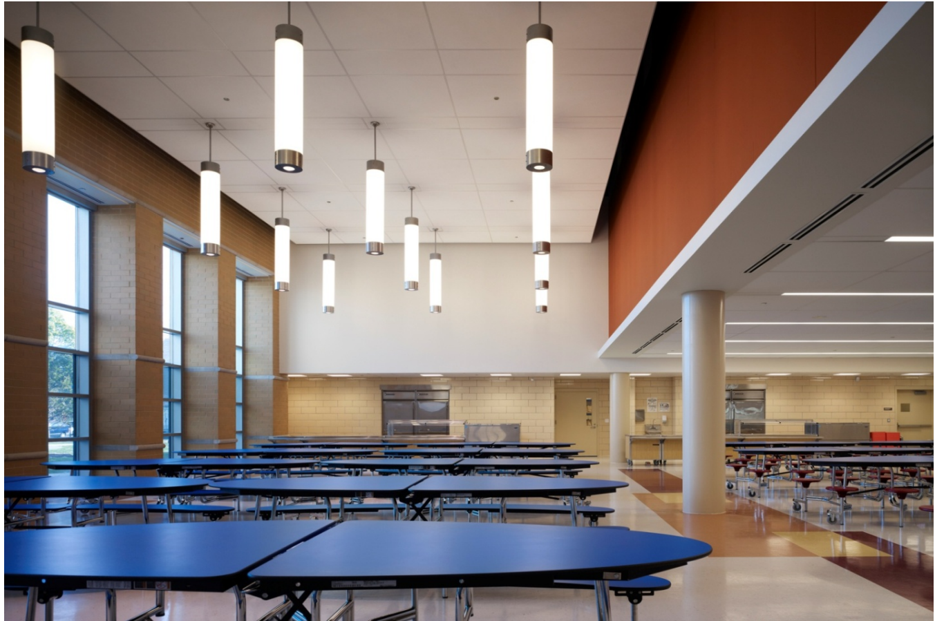
Kitchen and Dining Facilities at Calmecca Academy