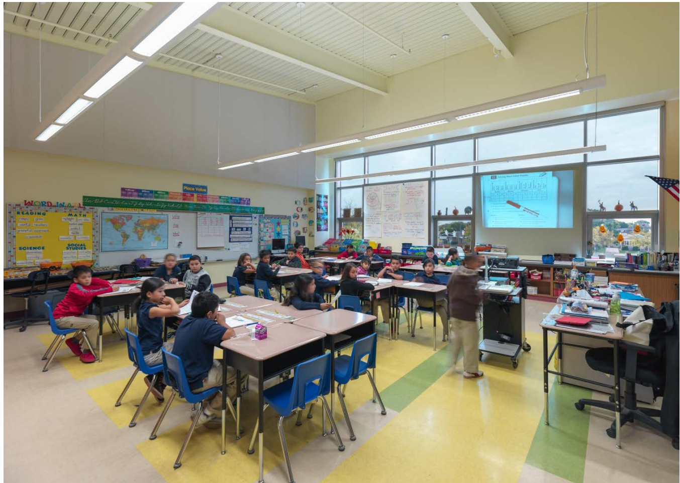
Standard Classroom at Stevenson Elementary