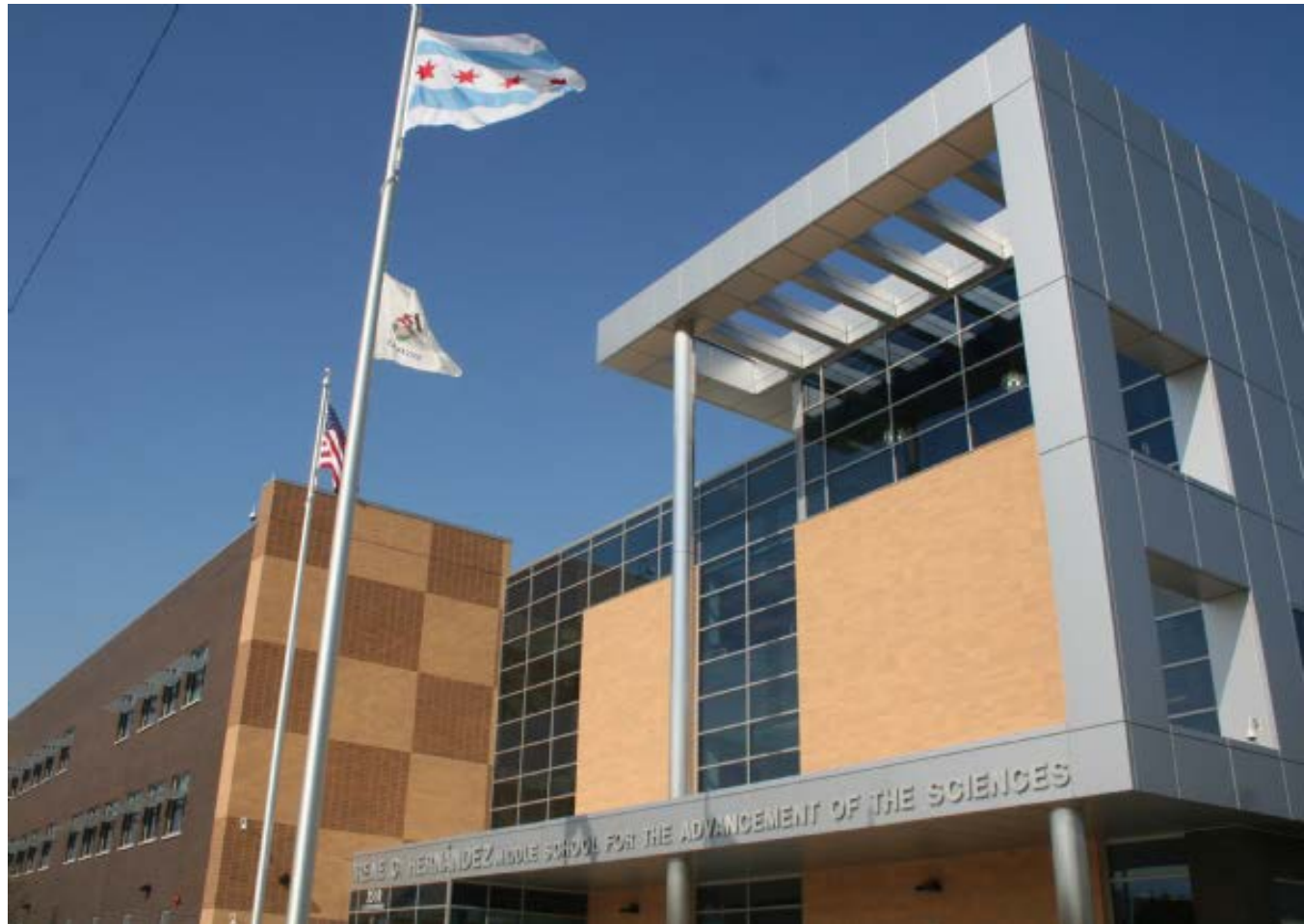
Irene C. Hernandez Middle School for the Advancement of the Sciences