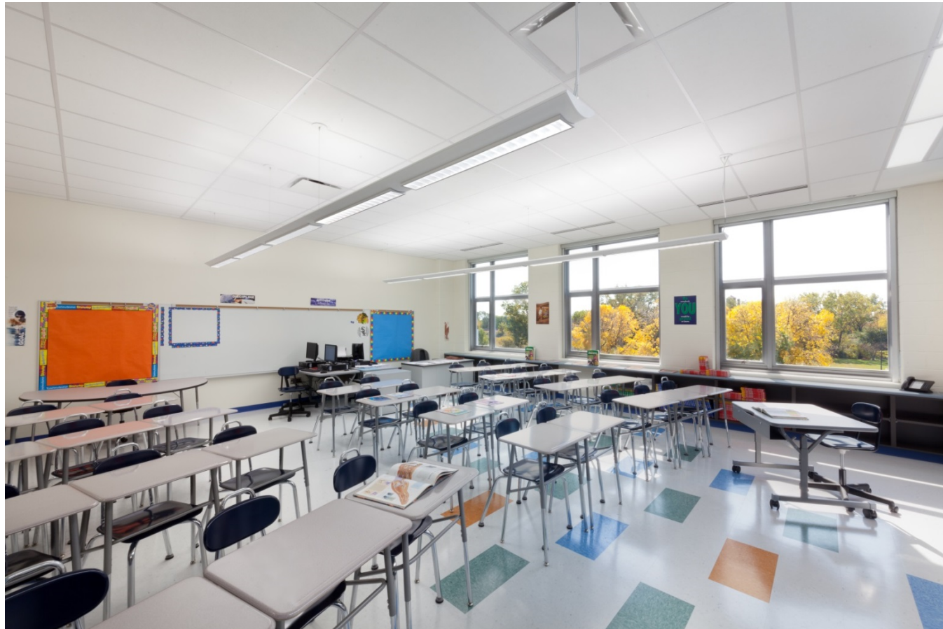
Standard Academic Classroom at Shields Middle School