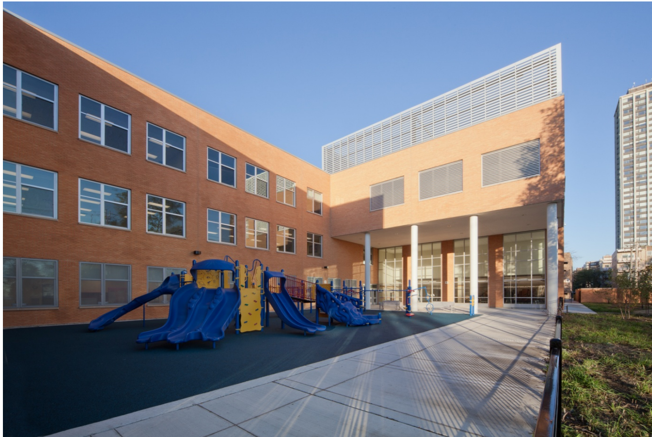
Playground at Powell Academy