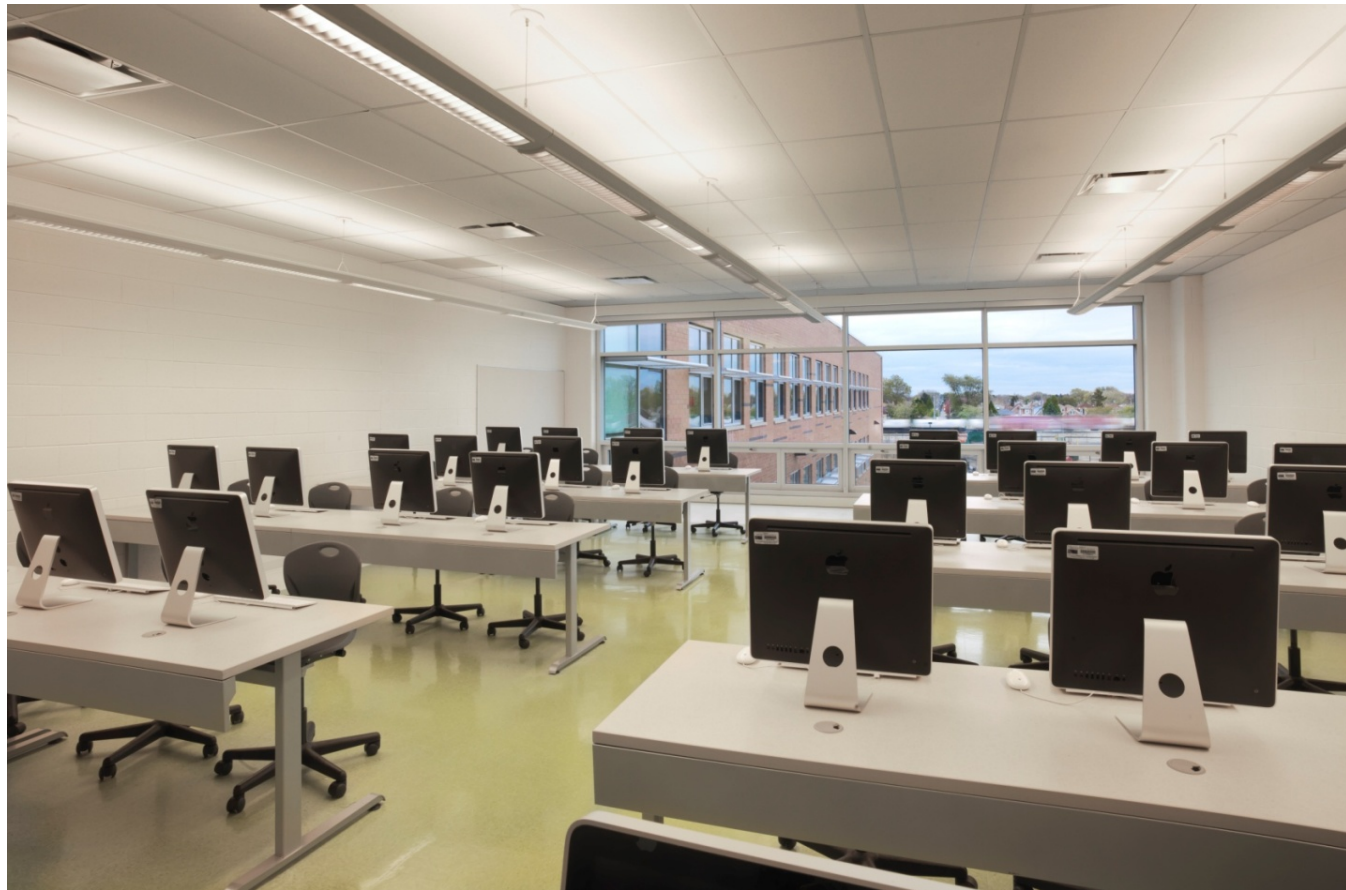
Lab at Azuela Elementary School