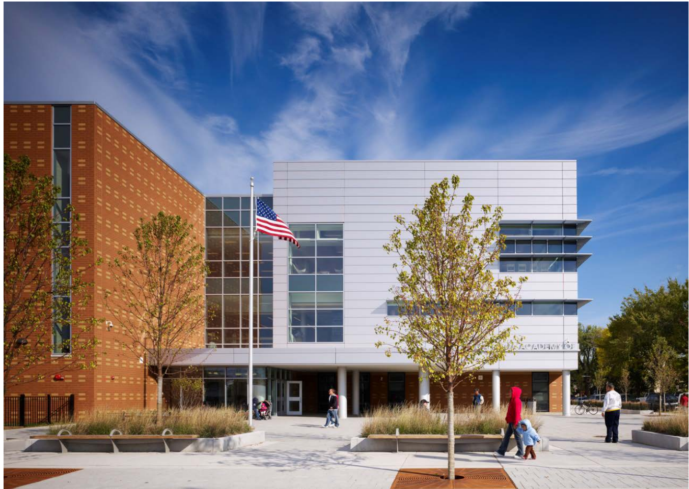
Calmecca Academy of Fine Arts & Dual Language