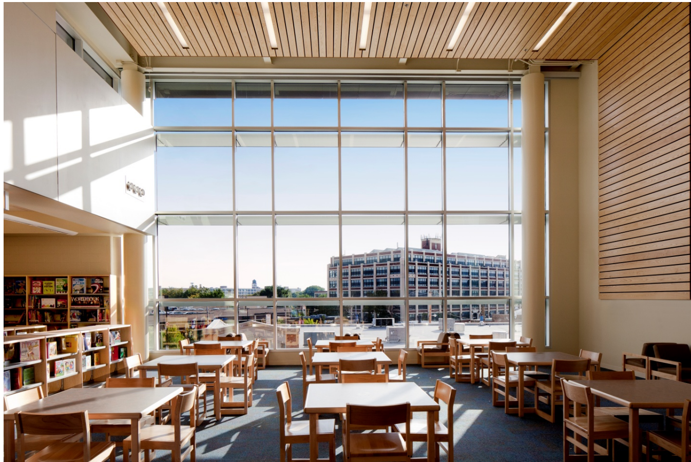
Library at Lorca Elementary School