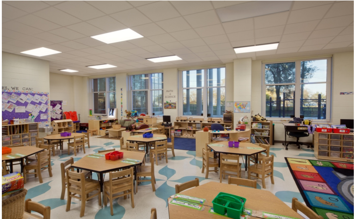
Pre-Kindergarten / Kindergarten Classroom at Powell Academy