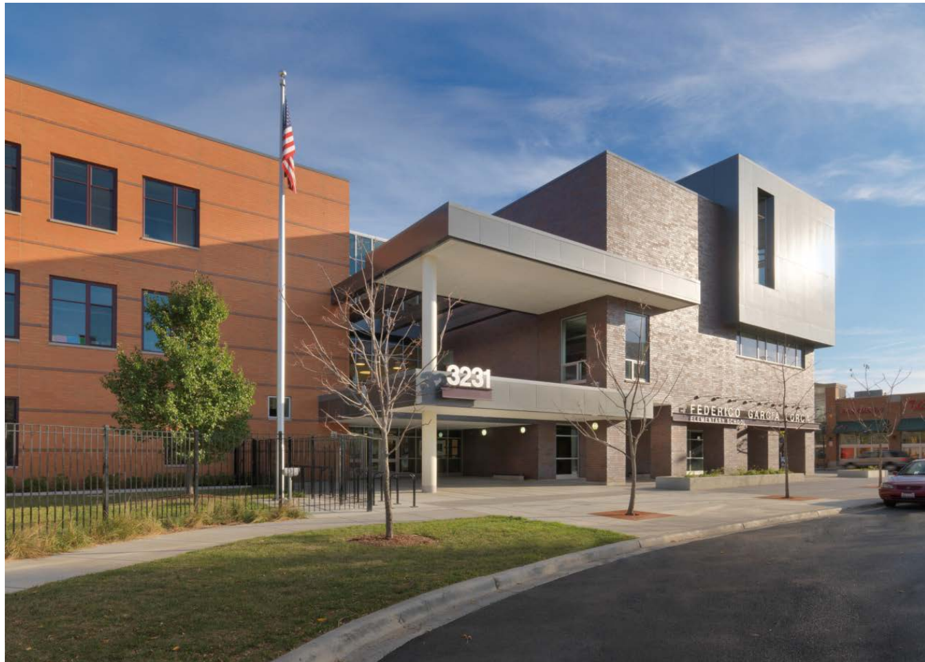
Federico Garcia Lorca Elementary School