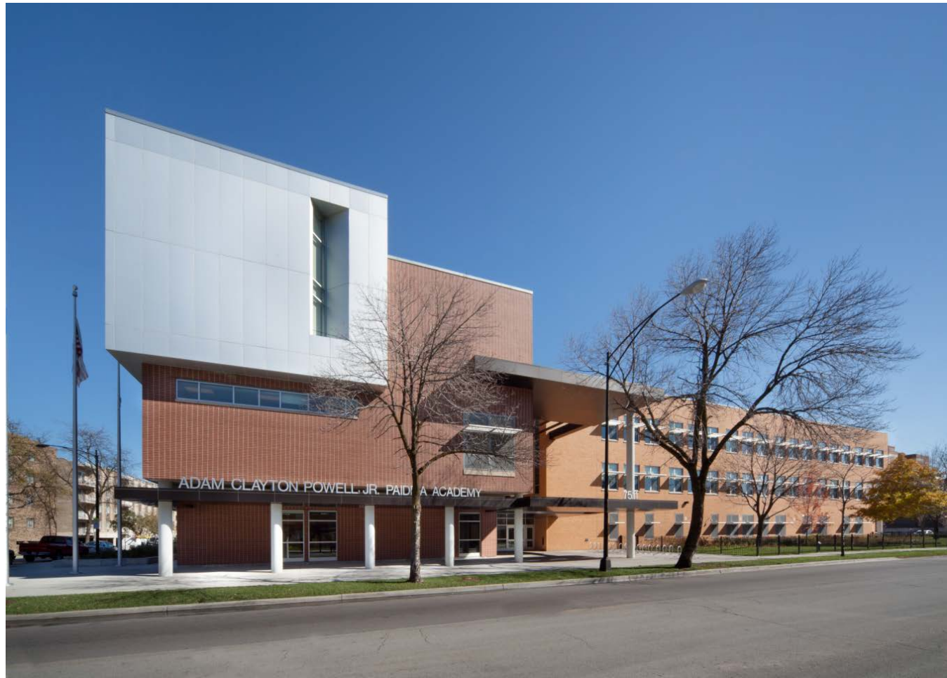
Adam Clayton Powell, Jr. Paideia Academy