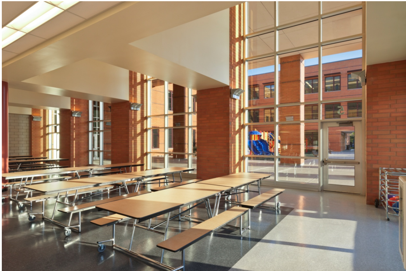
Kitchen and Dining Facilities at Lorca Elementary School