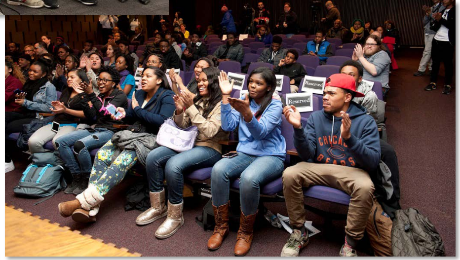
Event held at Woodson Regional Library