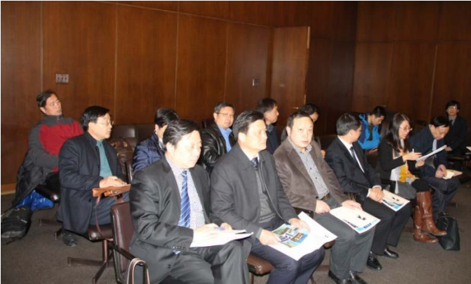
Board Meeting April 14, 2015