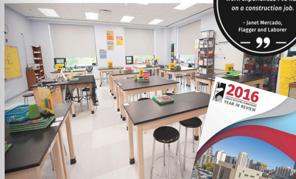
Opposite page: Walter Payton College Preparatory High School Annex; top left: Jamieson Elementary School Annex; bottom left: Edwards 1B Fine & Performing Arts Dual Language School Annex